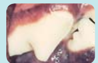
Healthy mouth with white teeth and healthy pink gums