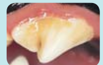
Unhealthy mouth with gingivitis and calculus